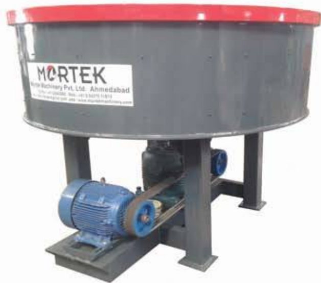
Single Shaft Mixture